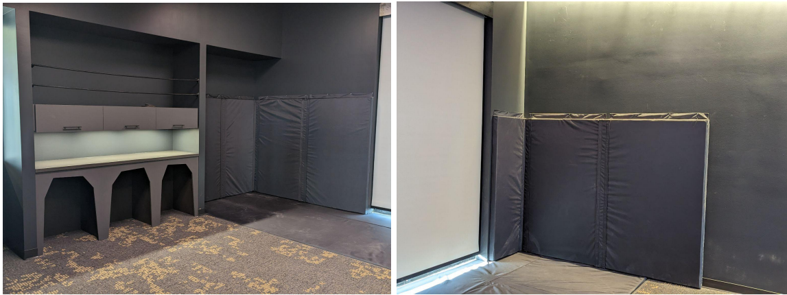
Sensory room with crash pads installed