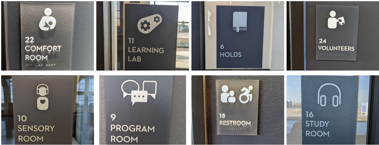
Room signage with iconography