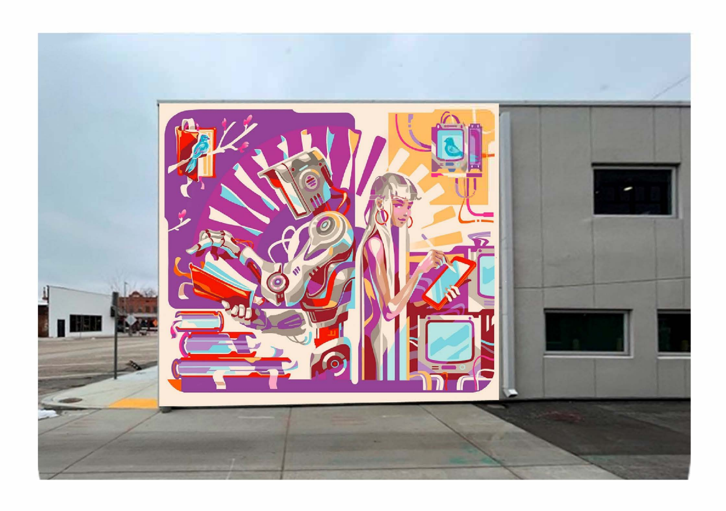
EXHIBIT B MURAL DESIGN CONCEPT